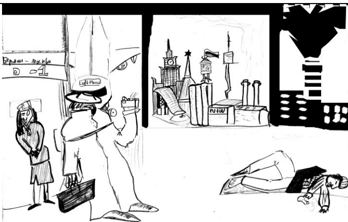
Прибытие в России Гражданина Германии

The air plane lands in metal waste. The pace of his is on his way. He slowly walks up to the window, seeing the landscape of a risen city. The bum softly takes a nap on the side of the walk way gap.